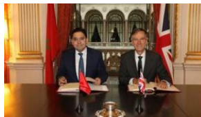
UK, Morocco sign continuity agreement