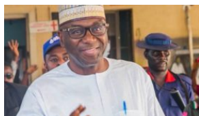
Women group applauds Gov. Abdulrazaq for nominating 56.25% women in his cabinet