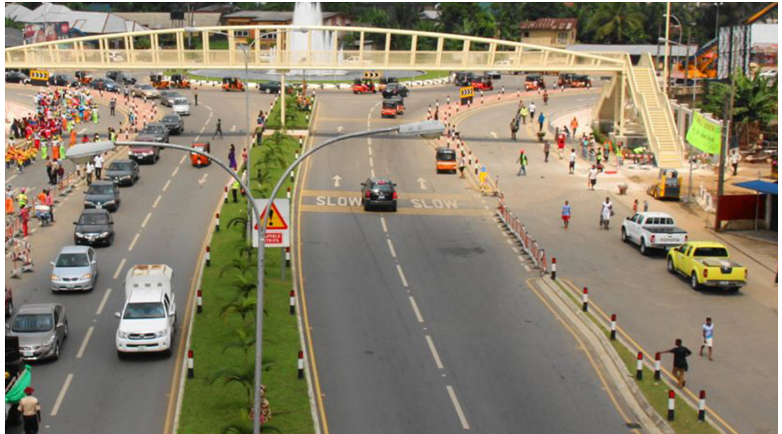
Akwa Ibom.

Three persons (two women and one man) were yesterday crushed to death while three others were seriously injured in an early morning accident, which occurred around Urua Ekpa Junction in Itu Local Council of Akwa Ibom State.