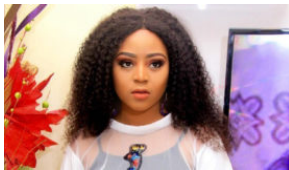
Police arrest man for alleged threat to Regina Daniels