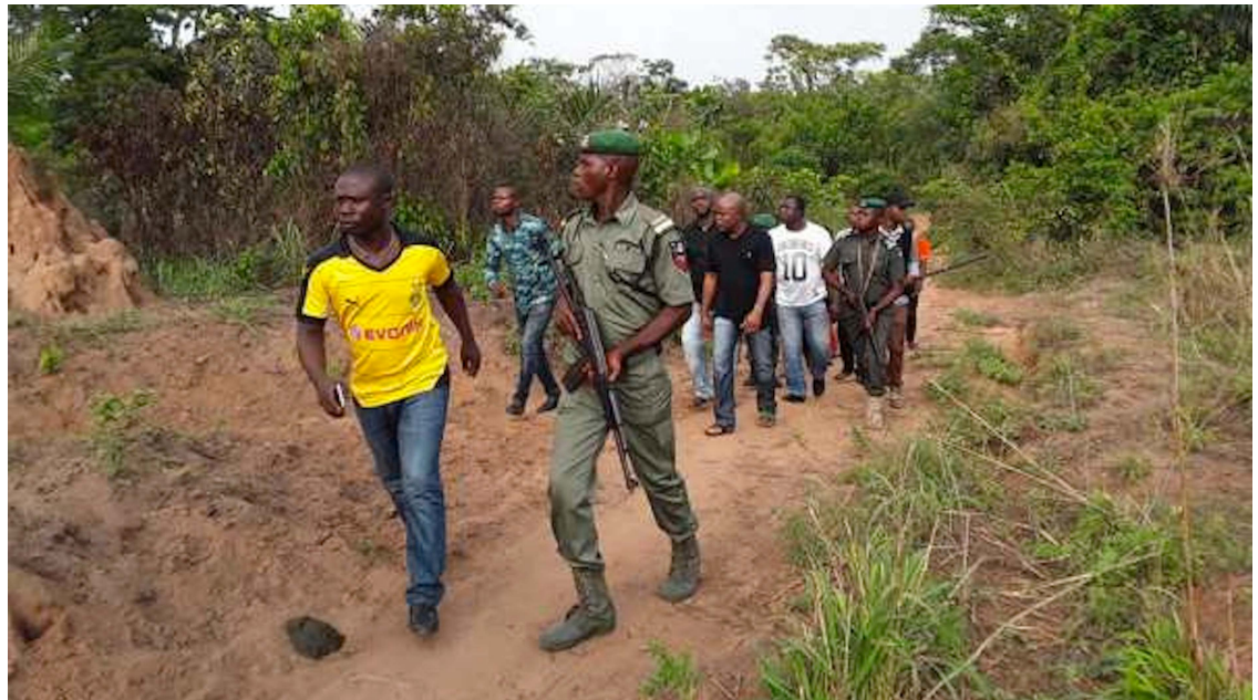
Some vigilance group members and policemen combing Delta forest after a recent attack