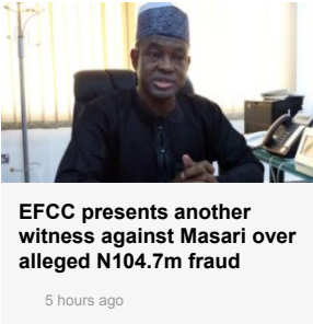
EFCC presents another witness against Masari over alleged N104.7m fraud