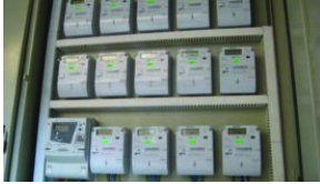
BEDC begins metering of customers in Edo