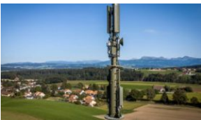
Health fears prompt Swiss 5G revolt