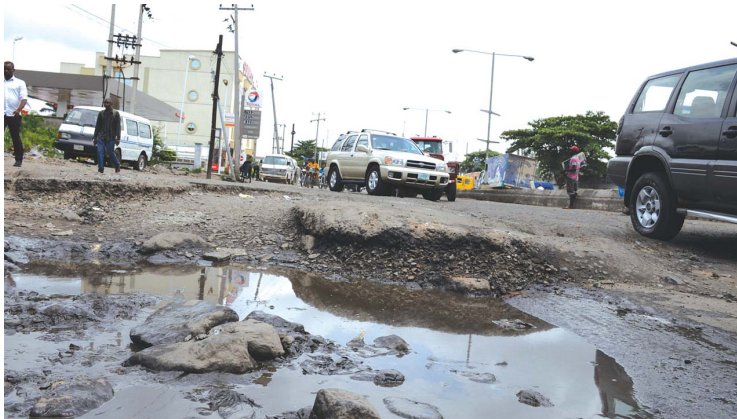
The lifeless body of a Lebanese inside a septic tank in his house at Apapa

Residents of Bombay Crescent in Apapa area of Lagos were thrown into confusion yesterday following the discovery of the lifeless body of a Lebanese inside a septic tank in his house.