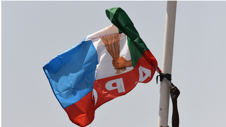
Flag of the All Progressives Congress (APC) party