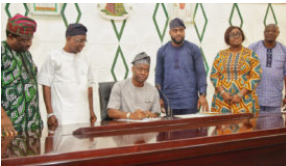
Makinde signs revised 2019 budget into law

In another development, four persons from the College of Education, Waka-Biu in Biu Local Government Area of Borno State have been confirmed dead while 12 were hospitalised. This was after they returned from a Yankari Games Reserve field trip. It was gathered that those who lost their lives complained of abdominal pains after which they vomited blood.