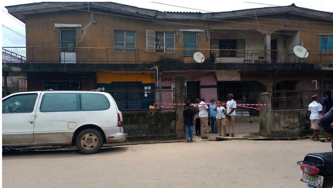
The premises sealed yesterday by Oshodi Local Government Area <br />