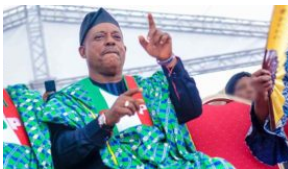
Cross River tribunal strikes out all appeals against PDP

Local council officials arrived later and sealed the building in the company of policemen from Makinde Police Station. An aggrieved resident who pleaded anonymity said, "It is wrong. Nobody is explaining anything to us. We were not even allowed to pick a pin from the building."