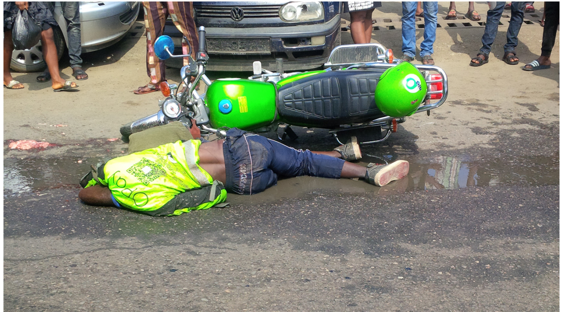
Scene of the accident.

Barely 48 hours after a truck belonging to a cement company rammed into a BRT bus killing three and injuring many others in Lagos, another truck conveying cows yesterday crushed an operator of motorbike ride-hailing service, ORide (OPay), to death at Iyana-Itire bus-stop on the Oshodi-Apapa expressway.