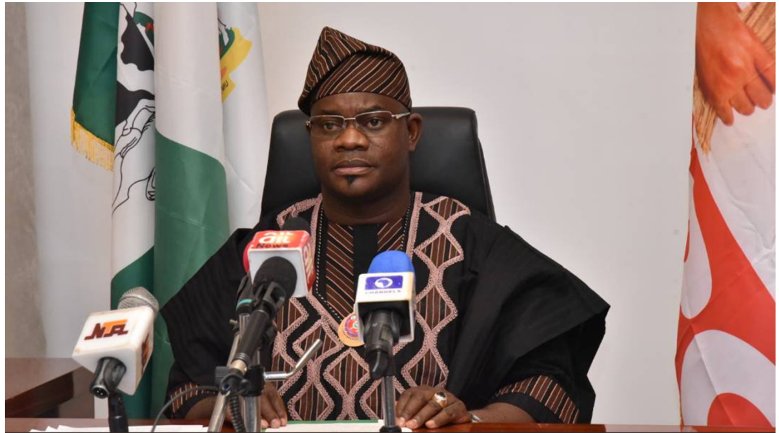
Yahaya Bello.