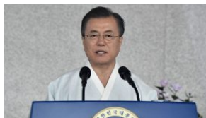
South Korea's Moon offers olive branch to Japan