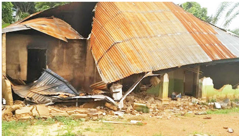
The deserted community

Mayhem has been unleashed on Odukpani Local Government Area of Cross River State following bloody communal clashes that have left over 50 people dead, with 10 communities leveled to the ground and more than 3,000 people displaced and rendered homeless.