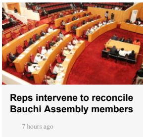
Reps intervene to reconcile Bauchi Assembly members