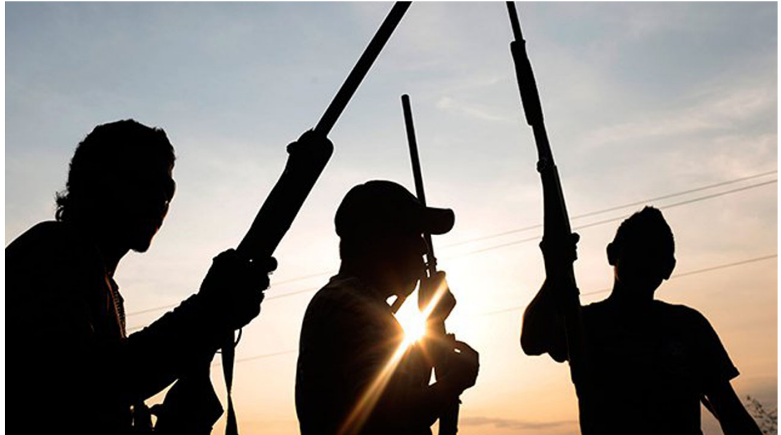
File Photo Gunmen