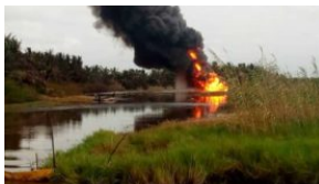
63 days after, Ojumole Well 1 fire incident ends, says Chevron