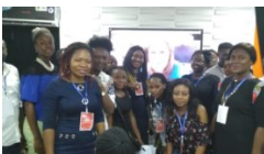
TalkLove Africa Foundation gives hope to those living with Autism