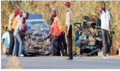
Accident claims 8 lives on Lagos-Ibadan expressway

Ifewara is the hometown of the General Overseer of the Redeemed Christian Church of God (RCCG), Pastor Enoch Adeboye and former Minister of External Affairs, Prof. Bolaji Akinyemi.