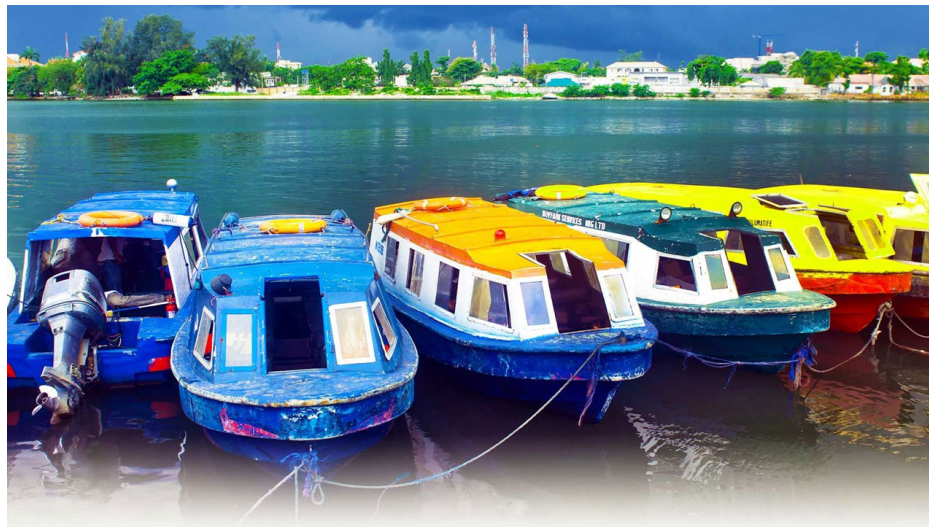
[FILES] Lagos boat

A boat mishap, which occurred at the weekend in Ipakan boat jetty, Egbin, Ikorodu area of Lagos State, has left 17 persons feared dead after being declared missing in the aftermath of a boat capsizing on Saturday night.