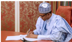
Buhari signs 2019 budget

In solidarity, the deceased colleagues, mainly Hausa riders, led a protest march on Makinde police station on Friday, which turned into a violent clash, as the protesters pelted the station and some policemen with stones and planks. It took the reinforcement of two armored tanks, mobile policemen and men of RRS to bring the situation under control after tear gas canisters were released on the area.