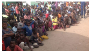
Tears of joy in Adamawa IDPs camp, as NNPC, Eroton Oil distribute relief materials