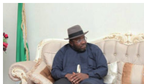
APC flays Dickson's campaign against IOCs