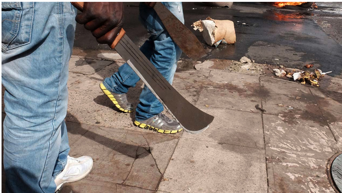
Cultists on rampage

The ongoing cult war between suspected members of Aiye and Eiye confraternities has led to the killing of four persons in different areas of Ijanikin, a Lagos community in the last three months.