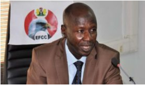
EFCC boss blames corruption for cause of poverty, insecurity in Nigeria

Abbey's killing on Tuesday saw petty traders, commercial motorcycle operators and shop owners scampering for safety as the assailants walked away on foot. An Okada rider, who also pleaded anonymity, said several persons ran into their houses when the boys, whose ages were between 19 and 25, started matcheting the guard.