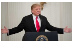
Trump says Russia election probe amounted to 'treason'

The doctor said that a medical examination he conducted on the pupil corroborated her account of the alleged defilement.