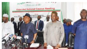
Protests in Abuja over issuance of certificate of return to Buhari

“Investigation revealed that the deceased was a lawyer who came to Lagos for a business meeting and lodged in a hotel at Opebi. The autopsy result revealed that the following factors led to the death of the victim: Exsanguination, which implies excessive loss of blood; Disruption of the left jugular vein and sharp force trauma.