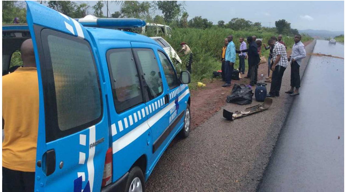
FRSC at a scene of accident

Six persons reportedly died on the spot and 10 others sustained serious injuries in a ghastly lone accident that involved a Benue State-bound bus from Ogbomoso. Eyewitnesses said the incident occurred on a bridge between Ajowa and Gedegede in Akoko Northwest local government area of Ondo State.