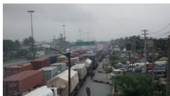
Stray bullet kills tanker driver in Lagos