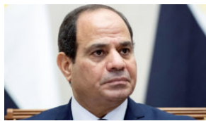
Egypt president opens first arms exhibition in Cairo