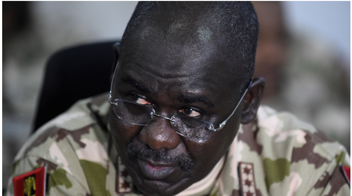
Chief of Army Staff Lieutenant General Tukur Buratai