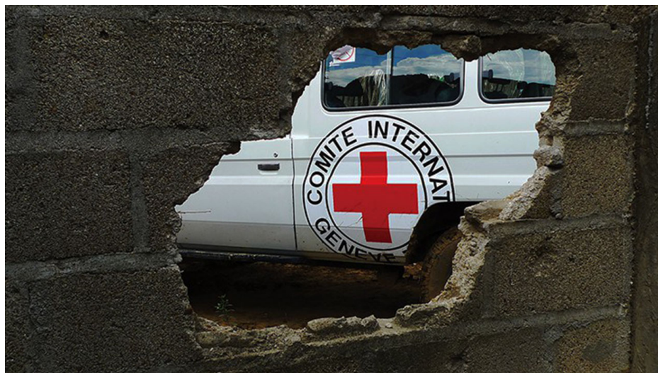
[FILE PHOTO] Vehicle of International Committee of the Red Cross (ICRC).