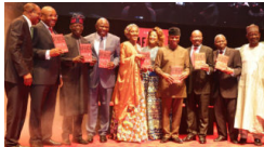
Tinubu, Amode meet at Jim Ovia's book launch