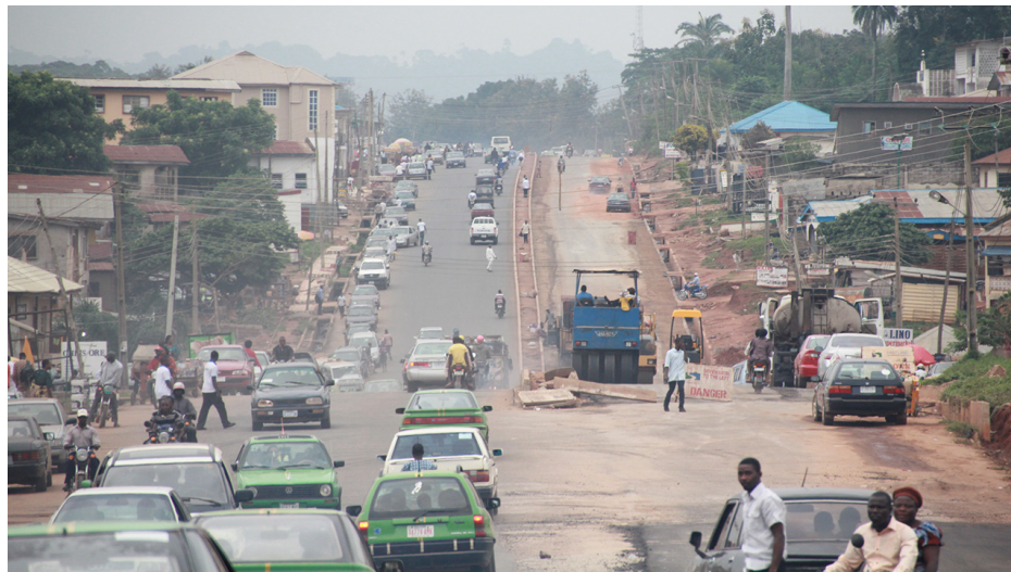
[FILE PHOTO] Ado Ekiti