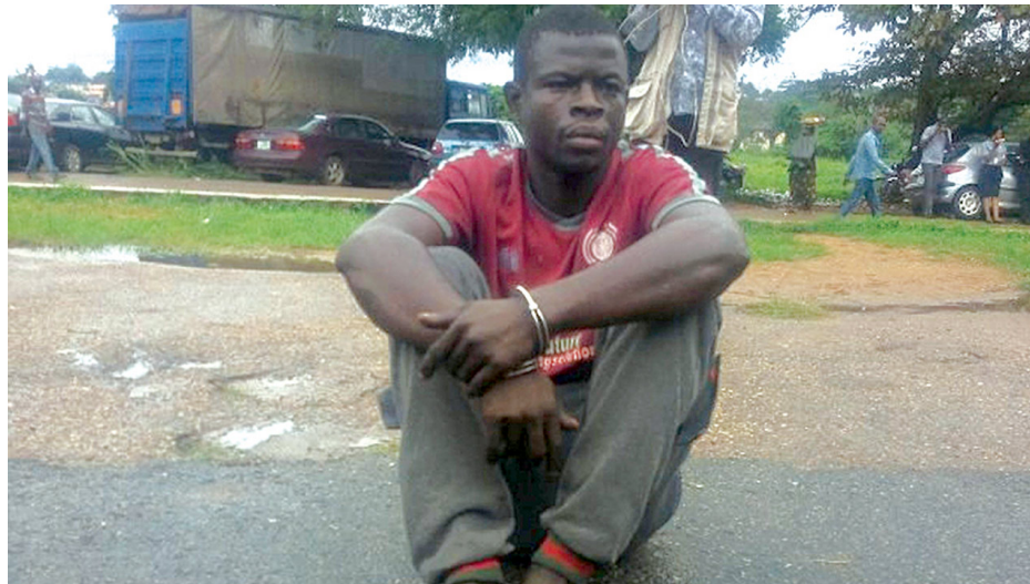
The suspect with the skulls