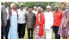
Monopoly, bureaucracy inimical to Nigeria's growth, says Osinbajo