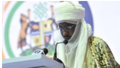
Sanusi warns politicians on exploitation of religion