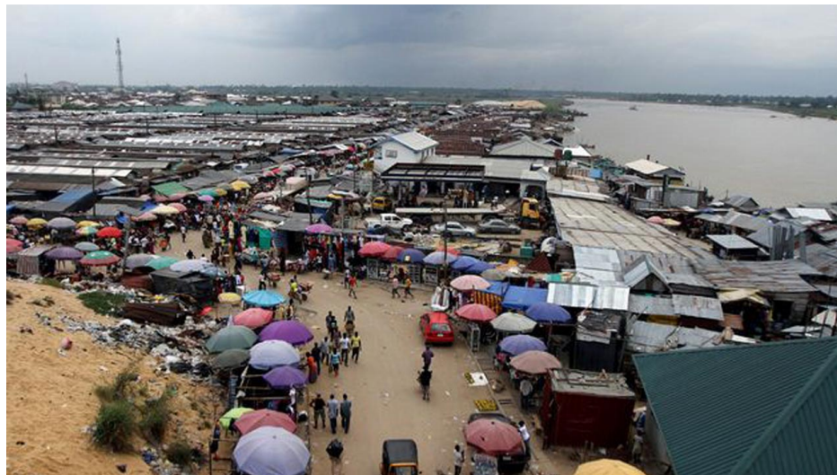
A part of Bayelsa.