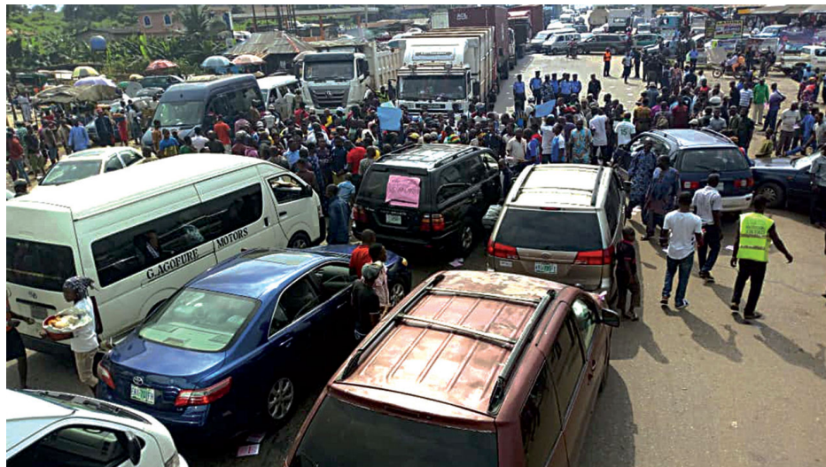
The Ondo youths protesters at Ore