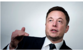
Elon Musk apologizes to British caver for 'pedo' slur

“Without any verifiable proof and basing your judgment from the proclivity of dissent serviced by a media report with anonymous attributions, you lent your voice to a fictitious story.