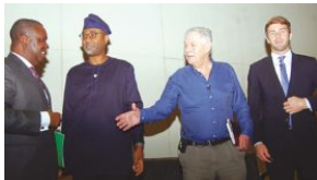
Stakeholders at gas roundtable seek policies to boost investment