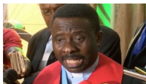
CAN warns government against execution of five Christians