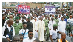
Catholics protest, caution government over killings

It was gathered that the university community was thrown into tension as sporadic gunshots and fired teargas canisters caused pandemonium among the residents in the university town