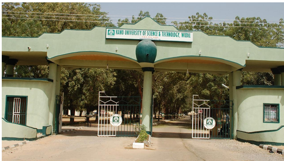
Kano University of Science and Technology

The authorities of Kano University of Science and Technology, Wudil, Kano State, has ordered the closure of the university for two weeks following students protest on Wednesday night over the death of their colleague.