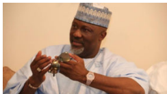
Dino Melaye to surrender self to police