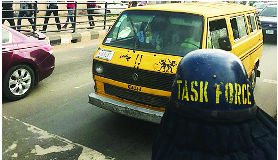
Task force at the scene to ensure law and order yesterday

Tragedy struck in the early hours of yesterday when the driver of a Bus Rapid Transit (BRT) along the Idi-Iroko/Ogolonto area of Ikorodu, Lagos State, yesterday crushed a primary school pupil, Ezekiel Daniel, to death, severing the head off at Ogolonto bus-stop, on Ikorodu Road.