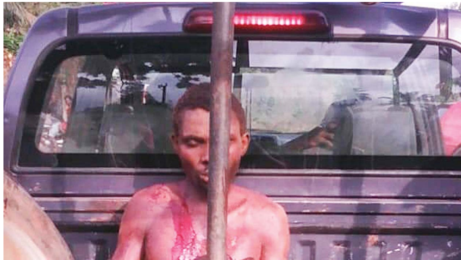
The suspect in police car