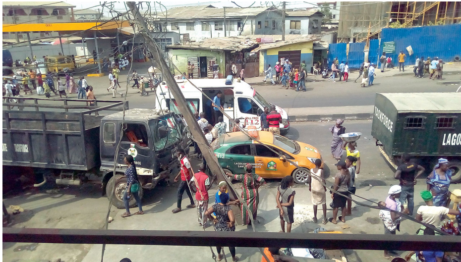
Scene of the incident yesterday with an ambulance taking away some of the injured.

For more than an hour, there were tense scenes in Mushin area of Lagos State after motorcycle riders clashed with the Lagos State Environmental Task Force, which left three people dead.