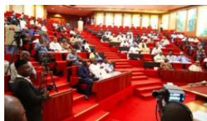
Uproar as Senate reverses election sequence of 2019