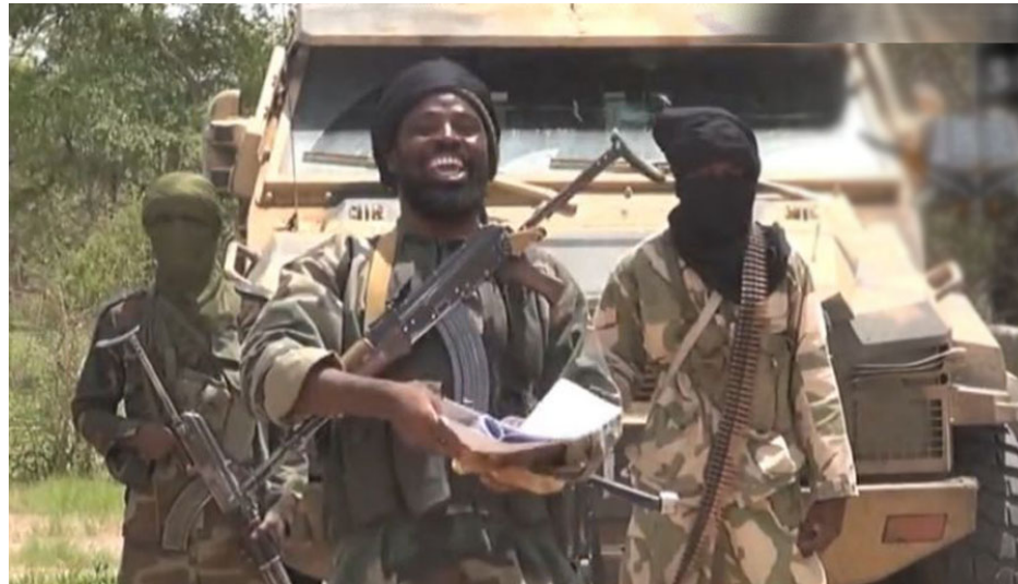
Boko Haram

Boko Haram jihadists have killed five people in an attack on a village in Adamawa state, northeast Nigeria, a community leader and a local resident said on Friday.