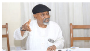
Government begins new minimum wage negotiations

By Murtala Adewale, Kano 24 November 2017 | 4:29 am