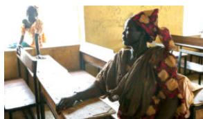
The mother who outsmarted Boko Haram for nine months by pretending to be mad