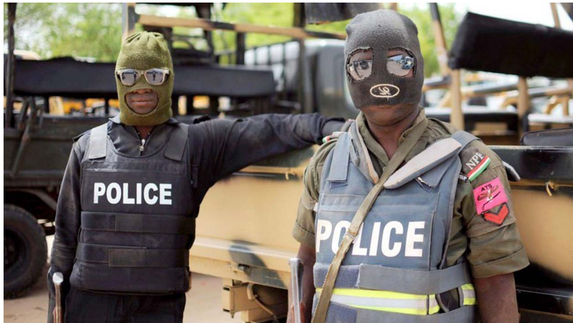
The State Criminal Investigation and Intelligence Department (SCIID) Panti-Yaba, Lagos, yesterday arraigned a man before a Magistrate Court, who claimed to be the Oba of Lagos and using same to perpetrate fraud in the proposed Lekki Airport Investment project.