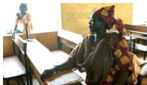
The mother who outsmarted Boko Haram for nine months by pretending to be mad