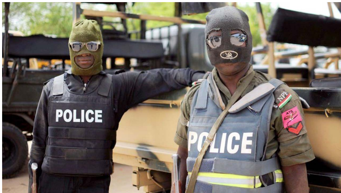
The State Criminal Investigation and Intelligence Department (SCIID) Panti-Yaba, Lagos, yesterday arraigned a man before a Magistrate Court, who claimed to be the Oba of Lagos and using same to perpetrate fraud in the proposed Lekki Airport Investment project.