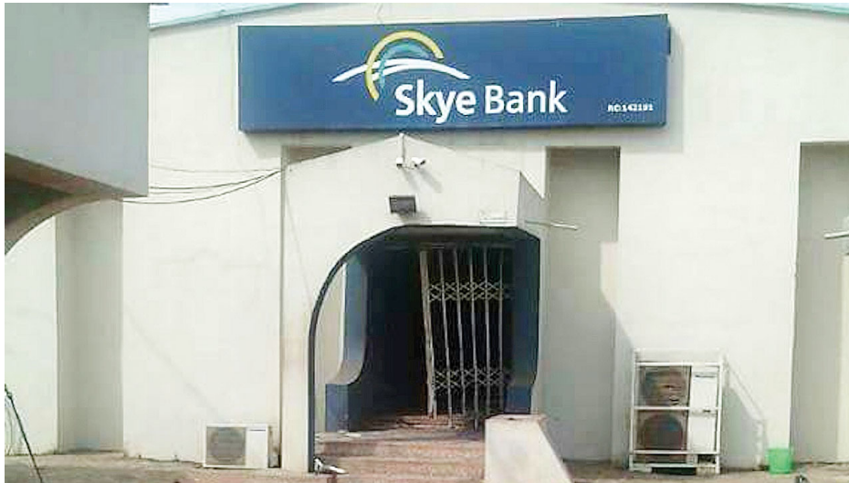
The robbery scene yesterday.