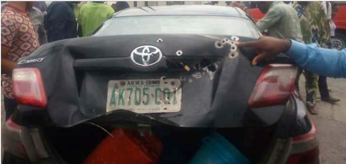
The bullet-ridden car

Home Nigeria World Politics Sport Opinion Business Technology Guardian Life Guardian TV