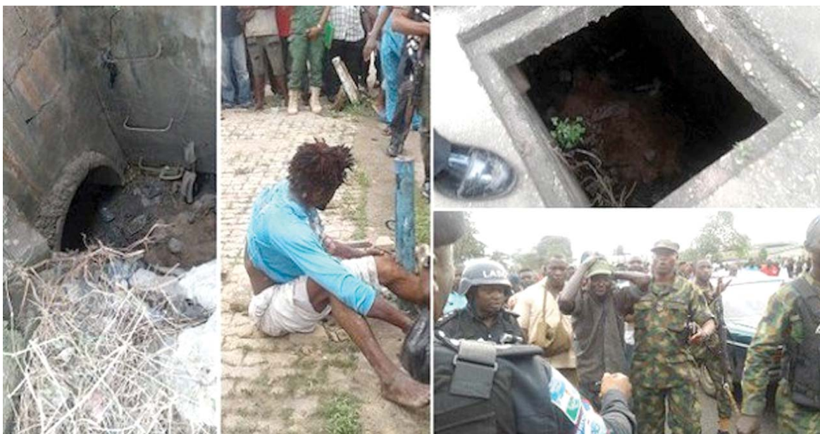
Scenes at the clampdown on the suspected ritualists yesterday.