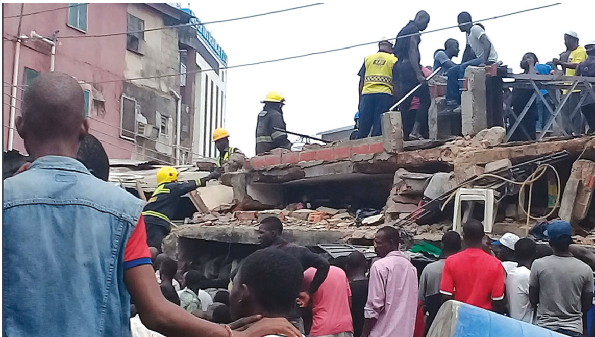
The building collapse site.