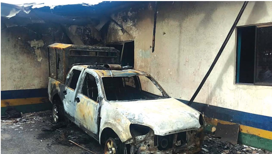
The burnt police station

Two policemen and a naval rating lost their lives on Tuesday night in Calabar, after some suspected naval officers attacked a police station in the capital city of Cross River State.