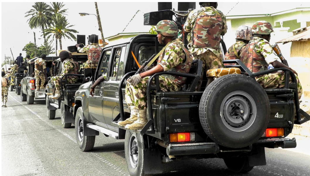
Nigeria Army.