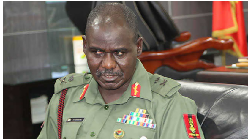
Chief of Army Staff, Gen. T. Y. Buratai