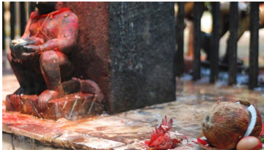
A native doctor's shrine